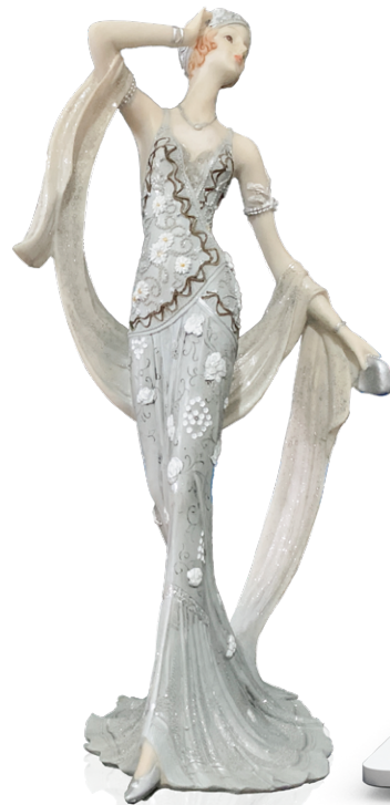
Handheld HD Scan Mode