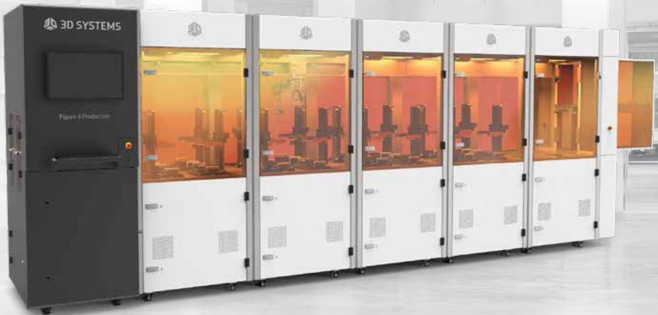
Figure 4 Production combines the design flexibility of additive manufacturing in configurable, in-line production cells to deliver a customizable and automated direct 3D production solution.

Industry's first customizable, fully-integrated factory solution for direct digital production