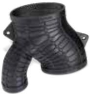
Figure 4 elastomeric materials are ideal for the production of functional rubber-like parts with excellent shape recovery, high tear strength, great for compressive applications and material malleability