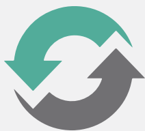
FIGURE 4 PRODUCTION RIVALS INJECTION MOLDED PART QUALITY WITH TOOL-LESS DIGITAL PRODUCTION TO DELIVER:

* Throughput improvement compared other 3D printing systems based on various use cases on Figure 4 Production; parts cost compared to traditionally manufactured parts and operations at a volume of 500 parts on Figure 4 Production