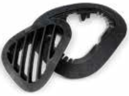
Figure 4 rigid materials produce durable plastic parts with the look and feel of cast urethane or injection molded parts, with features that include fast print speeds, high elongation, exceptional impact strength, humidity/moisture resistance, long-term environmental stability and more.